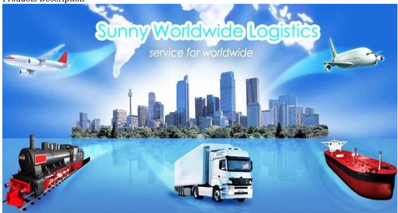
No Second In Shenzhen China—Sunny Worldwide Logistics <u>freight forwarder china</u> to USA Miami

Sunny worldwide logistics(SZ) Limited has more than 20 years of freight forwarding history, and over half of staffs working in Sunny about 5-13 years.