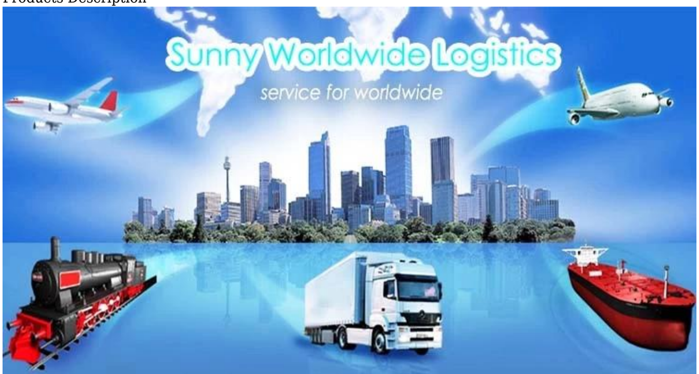
No Second In Shenzhen China—Sunny Worldwide Logistics shipping from china to