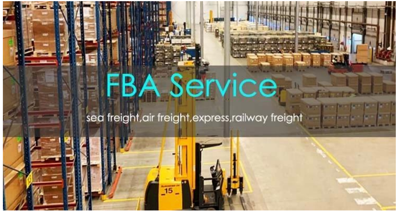
FBA Service——what we can do for you?