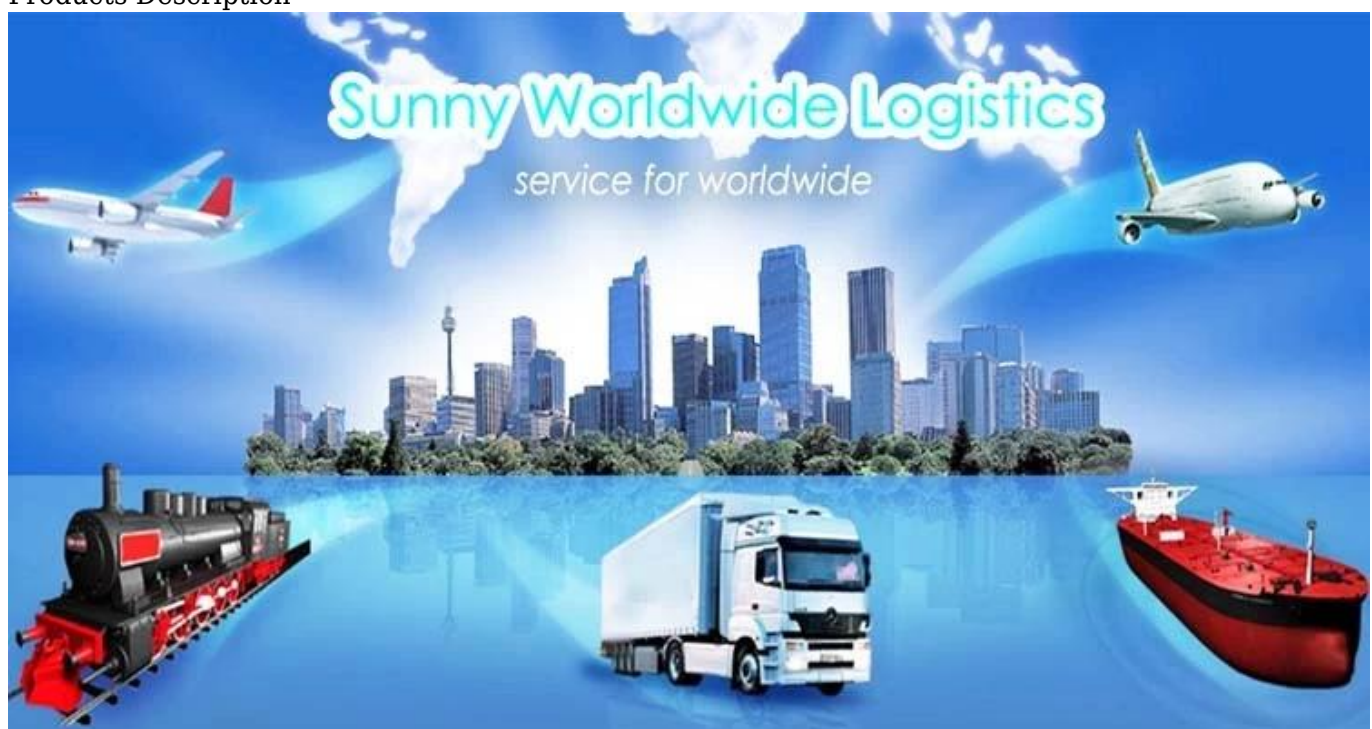
No Second In Shenzhen China—Sunny Worldwide Logistics

Sunny worldwide logistics(SZ) Limited has more than 20 years of freight forwarding history, and over half of staffs working in Sunny about 5-13 years.