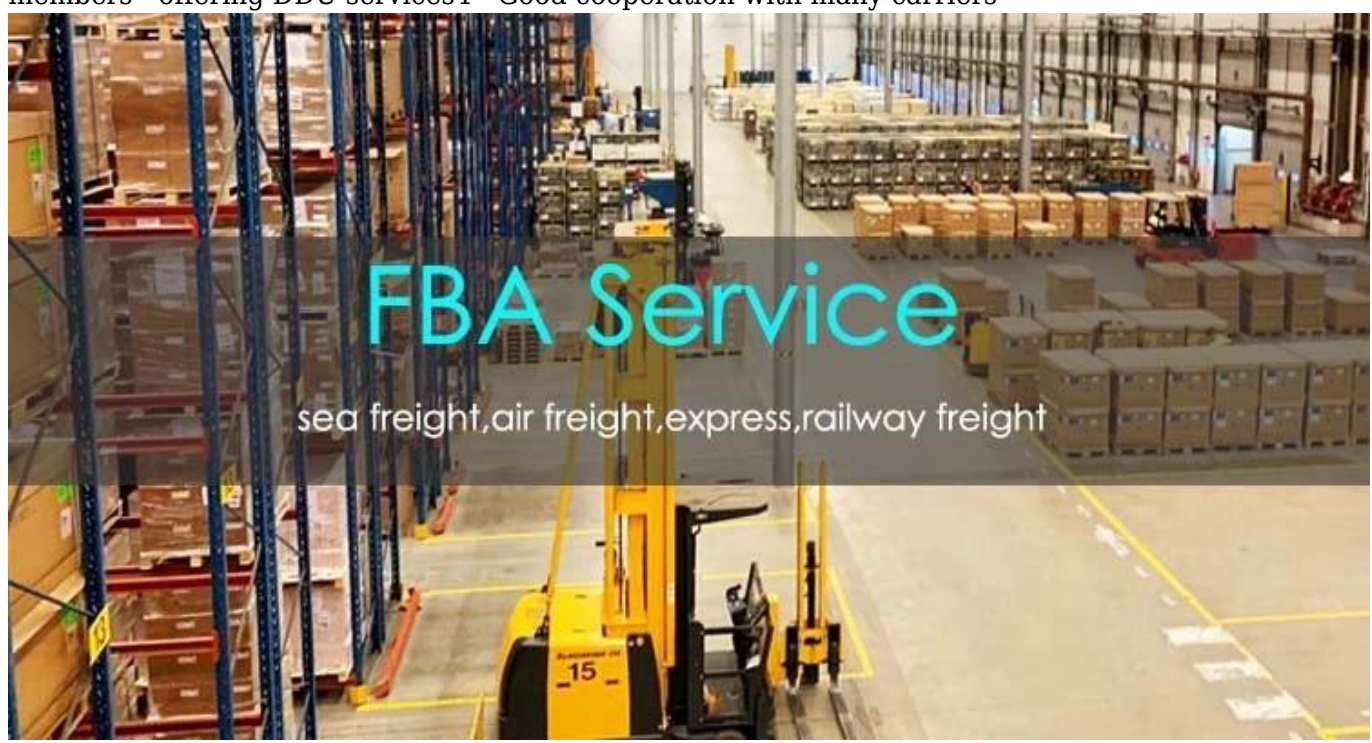
FBA Service—what we can do for you?

1 - Services covered all over China to Worldwide2 - Promptly feedback any proceedings3 - WCA members - offering DDU services4 - Good cooperation with many carriers