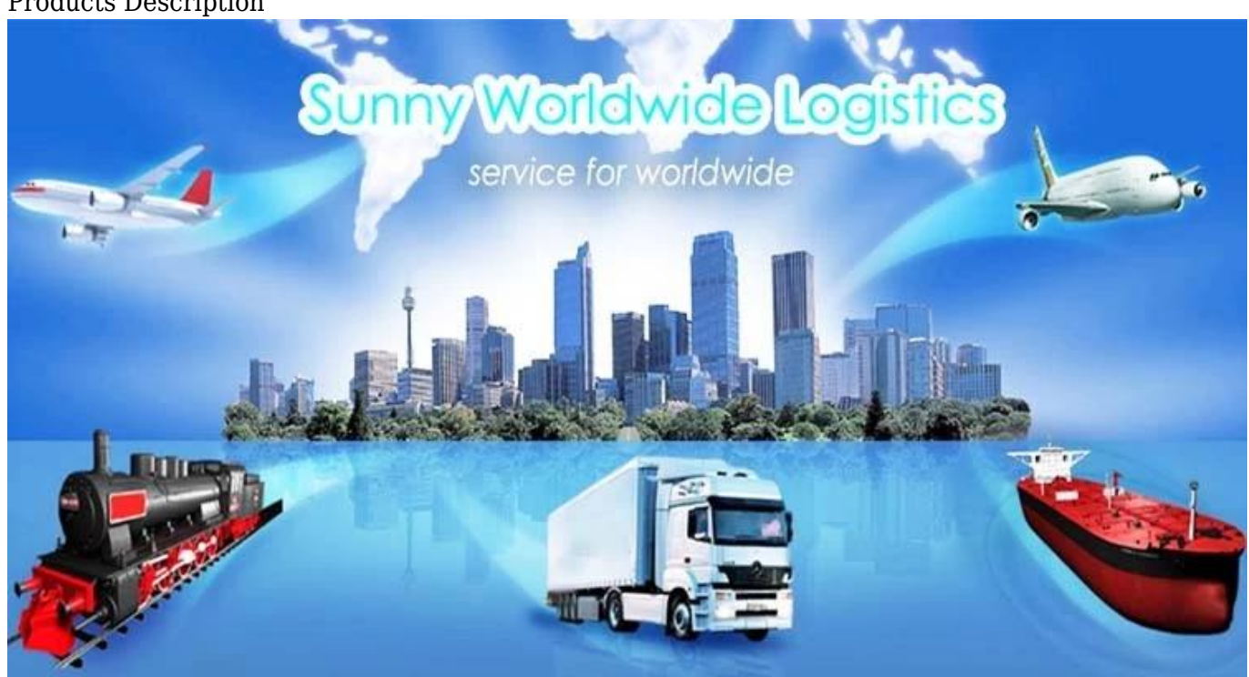
No Second In Shenzhen China—Sunny Worldwide Logistics

we were established in 1998, it is a full-service domestic and international freight forwarder based in China.Our partnership with a web of experienced and trusted international offices has allowed us to deliver the best logistical solutions for all of our customers's unique needs. we focus on the reliable customer service and company transport. Wehandle both ocean freight and air freight service, and we have agreements with all the major ocean shipping lines & airlines. Products Description