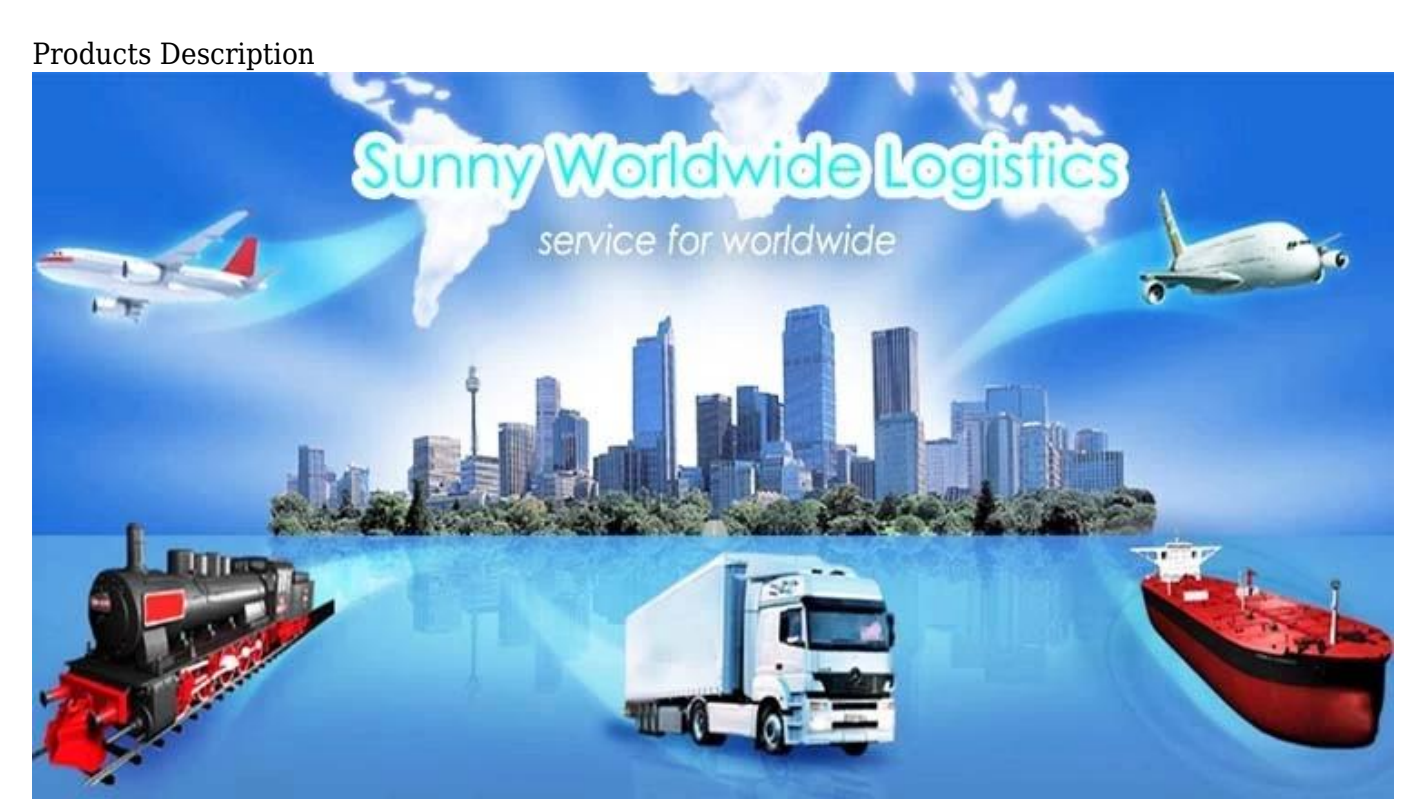
No Second In Shenzhen China—Sunny Worldwide Logistics

Sunny worldwide logistics(SZ) Limited has more than 20 years of freight forwarding history, and over half of staffs working in Sunny about 5-13 years.