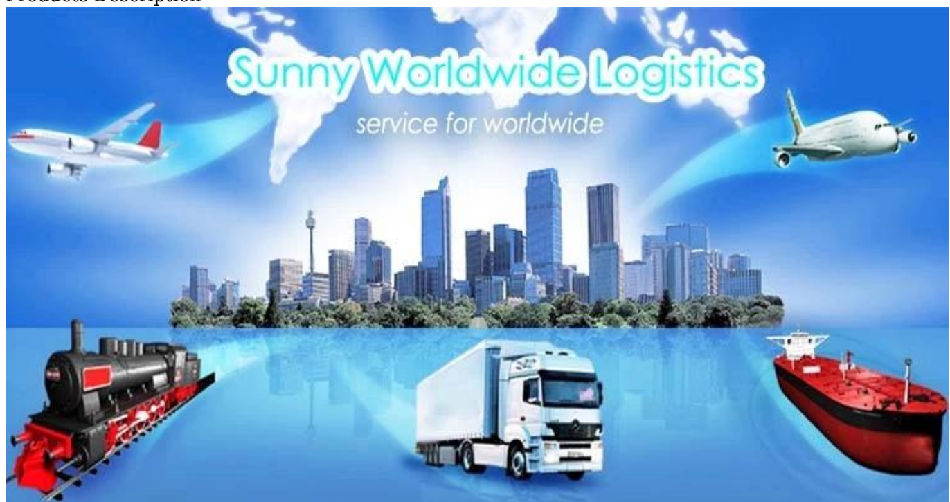
No Second In Shenzhen China—Sunny Worldwide Logistics <u>export to china to</u> Portugal

Sunny worldwide logistics(SZ) Limited has more than 20 years of freight forwarding history, and over half of staffs working in Sunny about 5-13 years.