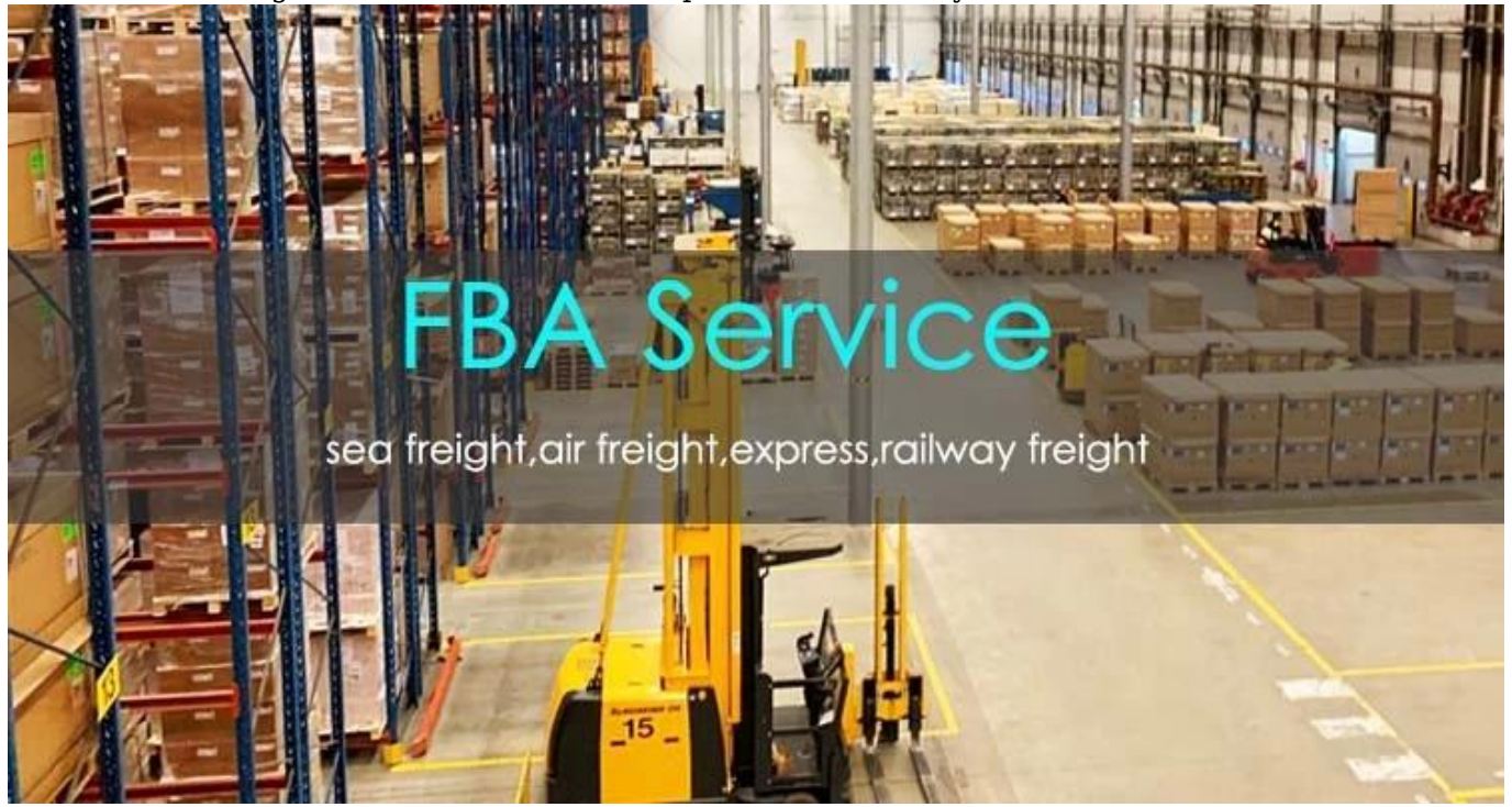
FBA Service—what we can do for you?

members - offering DDU services4 - Good cooperation with many carriers