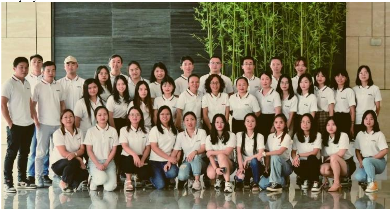
About us from china to Europe by sea and air door to door

we were established in 1998, it is a full-service domestic and international freight forwarder based in China.Our partnership with a web of experienced and trusted international offices has allowed us to deliver the best logistical solutions for all of our customers's unique needs. we focus on the reliable customer service and company transport. Wehandle both ocean freight and air freight service, and we have agreements with all the major ocean shipping lines & airlines.