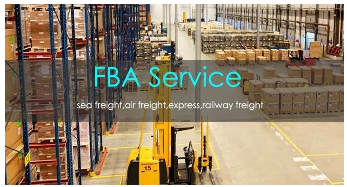
FBA Service—what we can do for you?