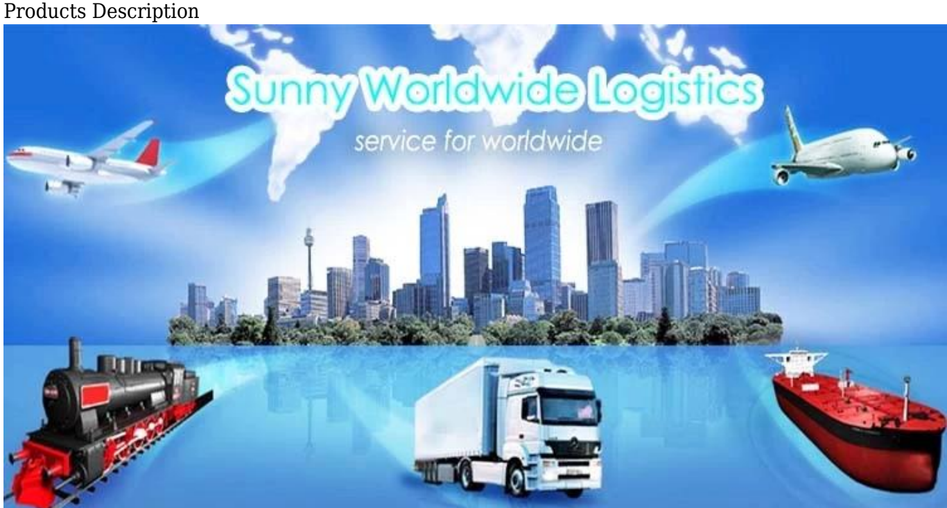
No Second In Shenzhen China—Sunny Worldwide Logistics

we were established in 1998, it is a full-service domestic and international freight forwarder based in China.Our partnership with a web of experienced and trusted international offices has allowed us to deliver the best logistical solutions for all of our customers's unique needs. we focus on the reliable customer service and company transport. Wehandle both ocean freight and air freight service, and we have agreements with all the major ocean shipping lines & airlines.