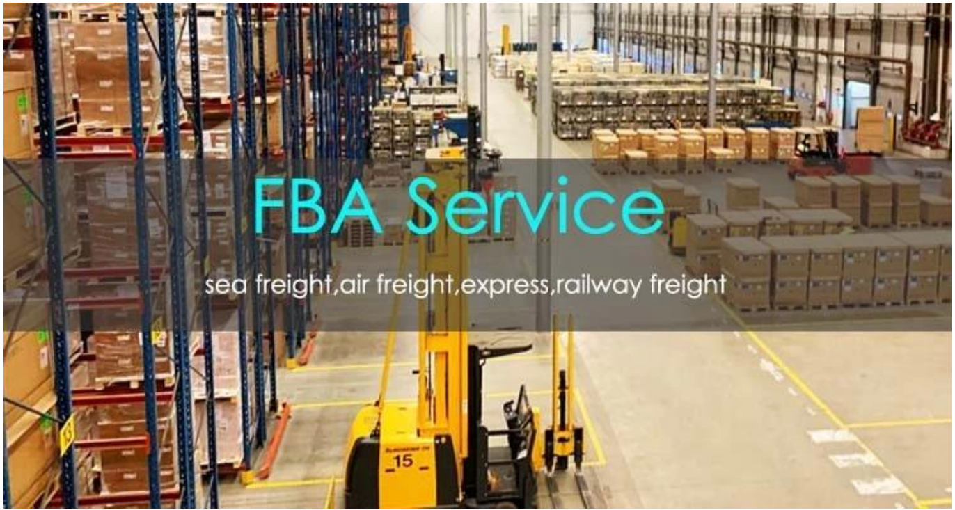
FBA Service——what we can do for you?