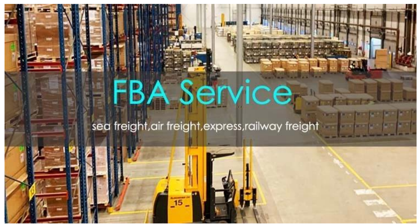
FBA Service——what we can do for you?