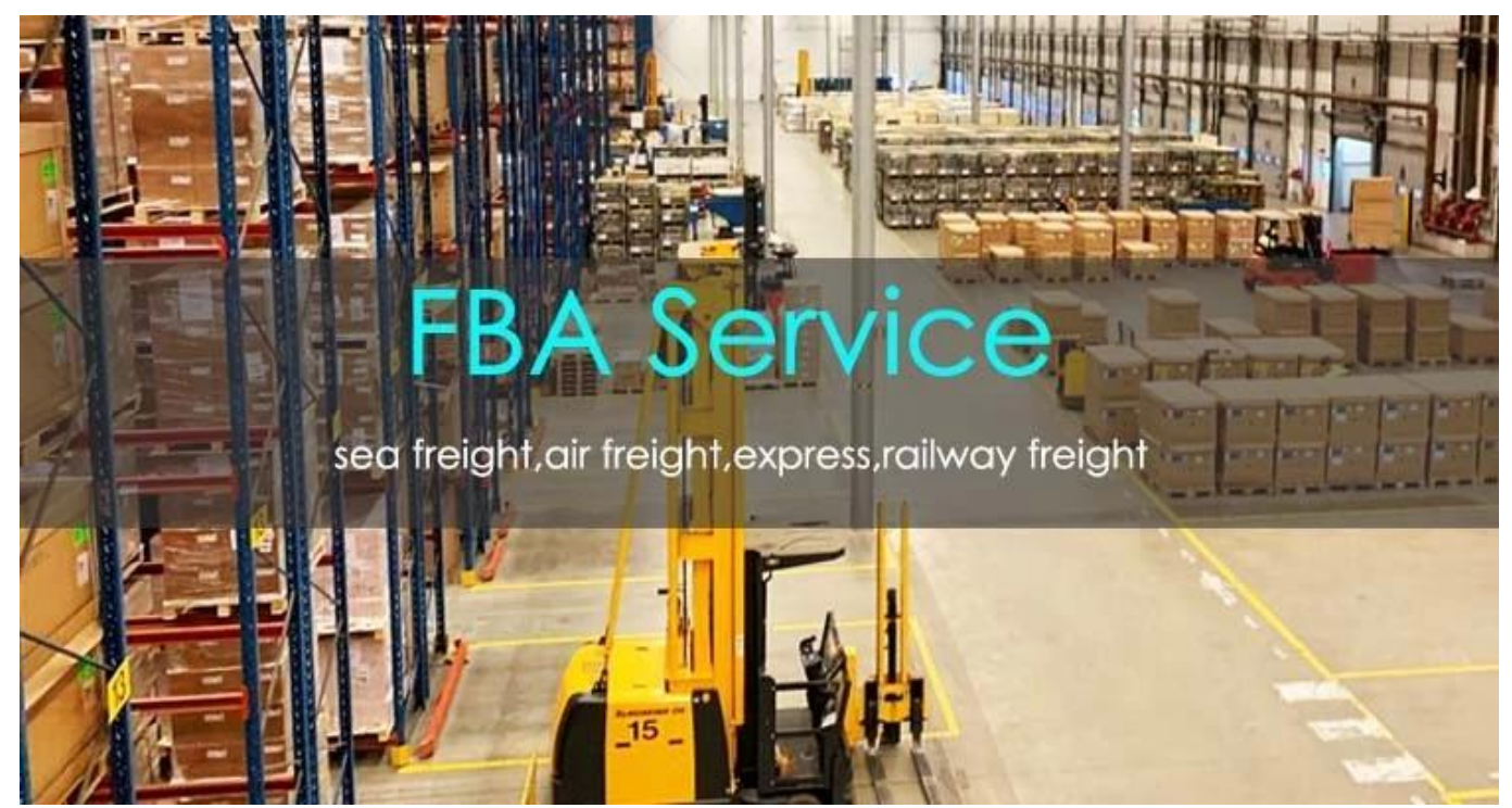
FBA Service——what we can do for you?