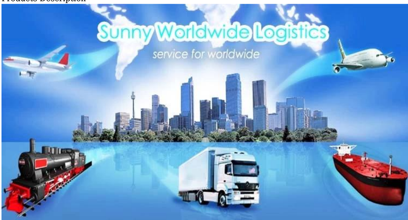
No Second In Shenzhen China—Sunny Worldwide Logistics

Sunny worldwide logistics(SZ) Limited has more than 20 years of freight forwarding history, and over half of staffs working in Sunny about 5-13 years.