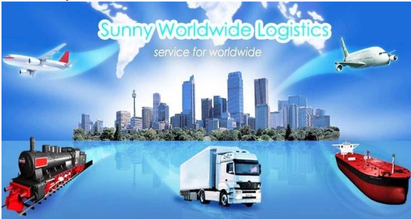
No Second In Shenzhen China—Sunny Worldwide Logistics

Sunny worldwide logistics(SZ) Limited has more than 20 years of freight forwarding history, and over half of staffs working in Sunny about 5-13 years.