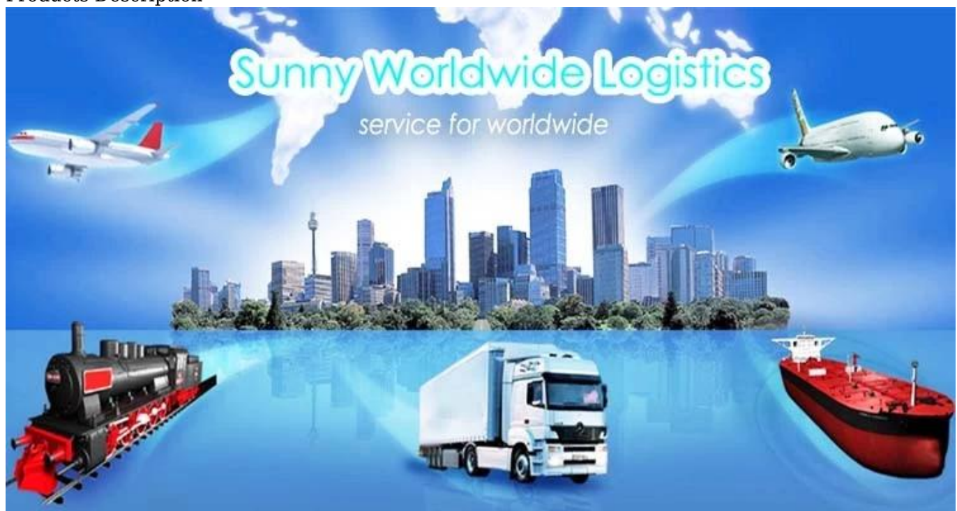
No Second In Shenzhen China—Sunny Worldwide Logistics china agent

Sunny worldwide logistics(SZ) Limited has more than 20 years of freight forwarding history, and over half of staffs working in Sunny about 5-13 years.