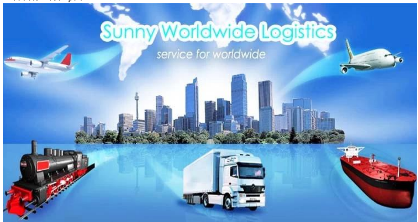
No Second In Shenzhen China—Sunny Worldwide Logistics

Sunny worldwide logistics(SZ) Limited has more than 20 years of freight forwarding history, and over half of staffs working in Sunny about 5-13 years.