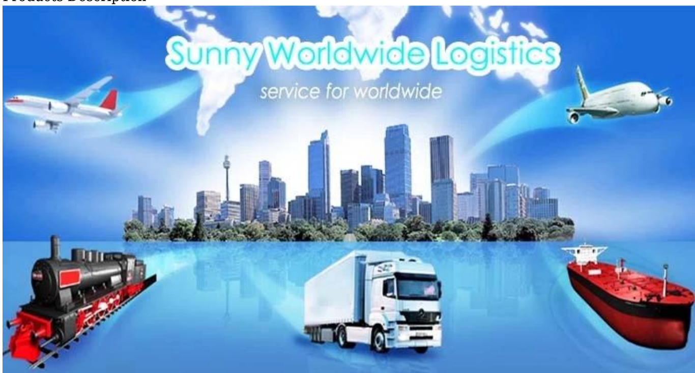
No Second In Shenzhen China—Sunny Worldwide Logistics

Sunny worldwide logistics(SZ) Limited has more than 20 years of freight forwarding history, and over half of staffs working in Sunny about 5-13 years.