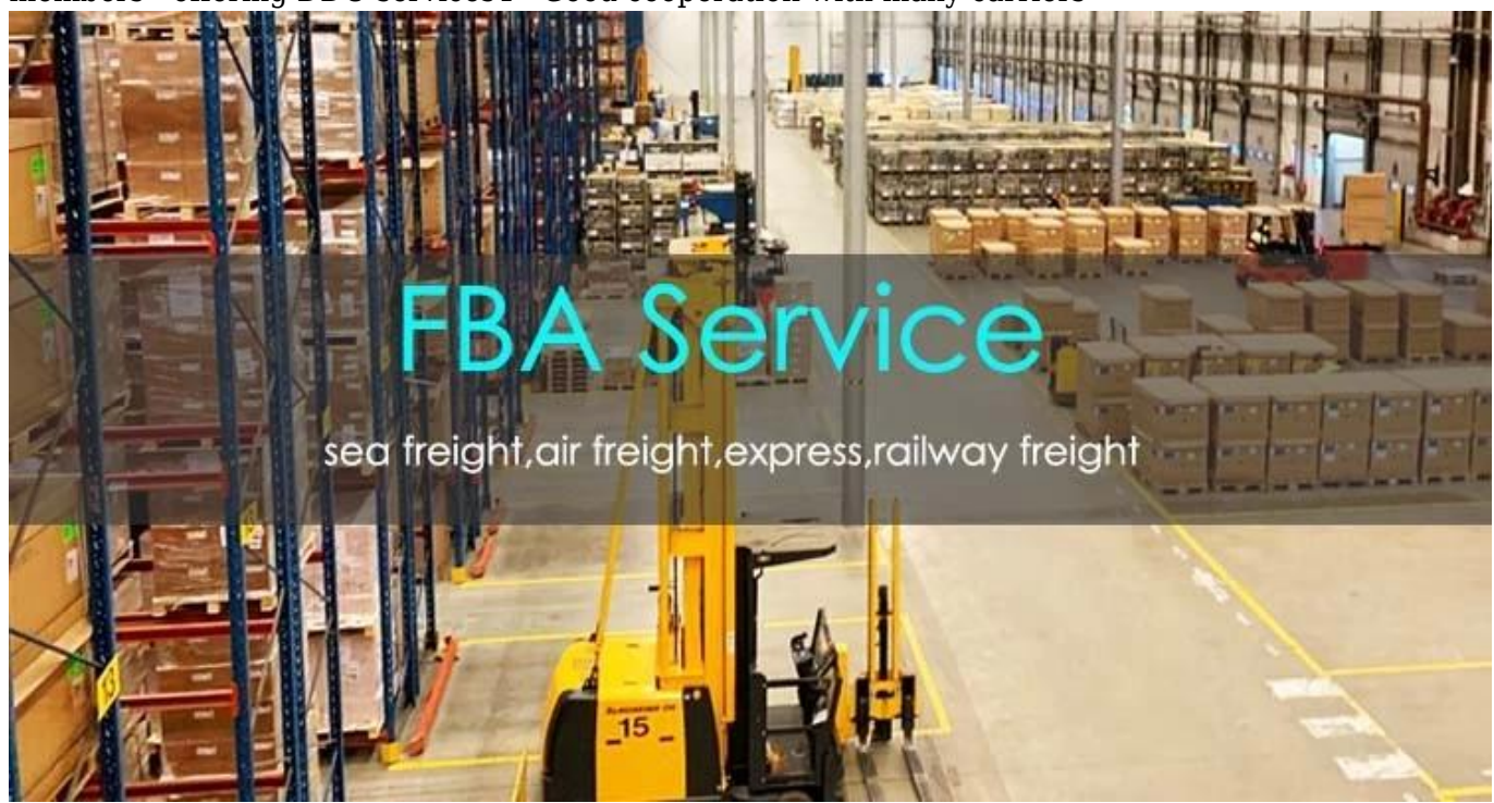
FBA Service—what we can do for you?

1 - Services covered all over China to Worldwide2 - Promptly feedback any proceedings3 - WCA members - offering DDU services4 - Good cooperation with many carriers